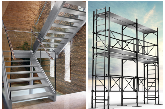
Stairs & Scaffolding